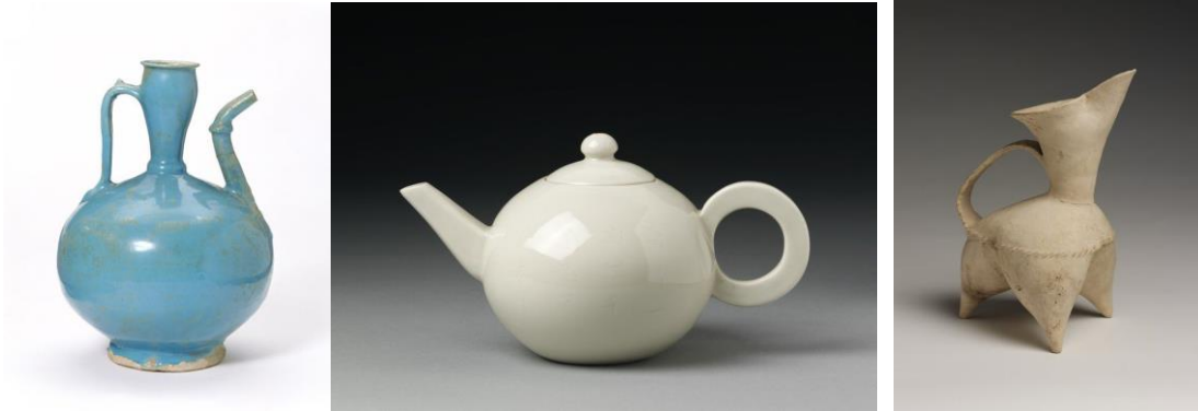
Spouted jug, 1180-1220 (made) Teapot and lid, ca. 1650-1700, Ewer, ca. 2500 BC (made)