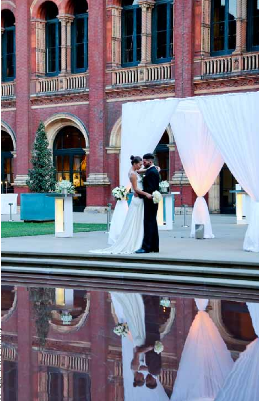
John Madejski Garden

Wedding Celebrations at the Victoria and Albert Museum South Kensington, London