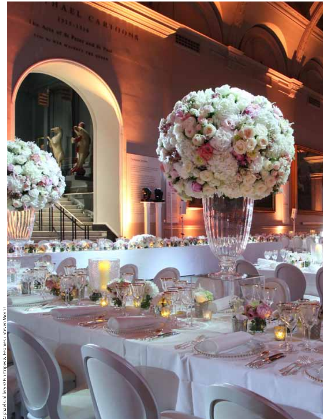
Raphael Gallery