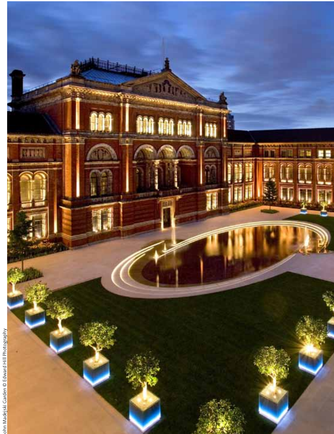
John Madejski Garden