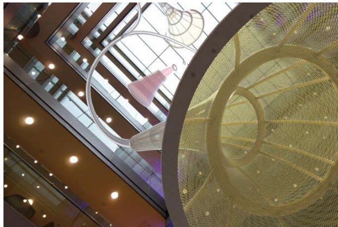
No.8 @ Arup, Atrium Installation © You & Me Architecture

NC Links: This workshop will contribute towards the following learning: