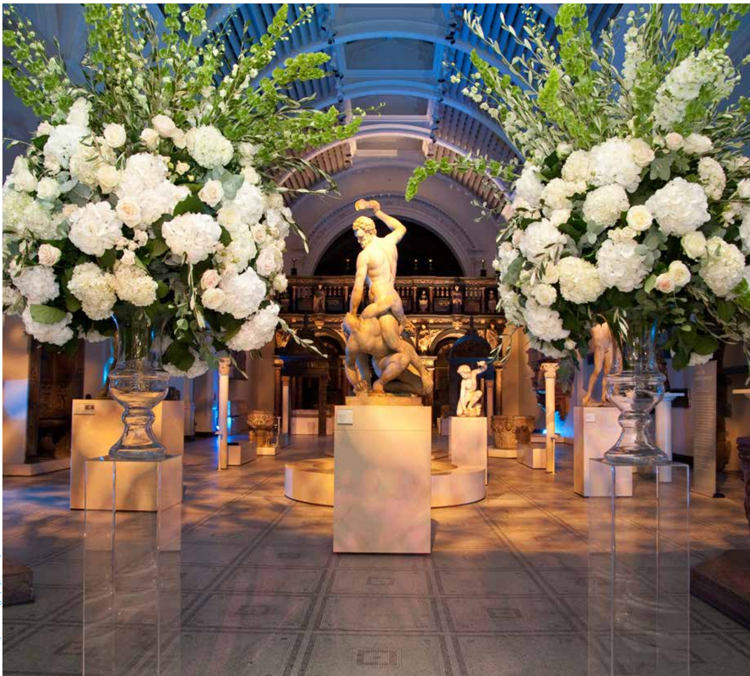
© Clarke Caplin Photography, Pinestripes and Peonies