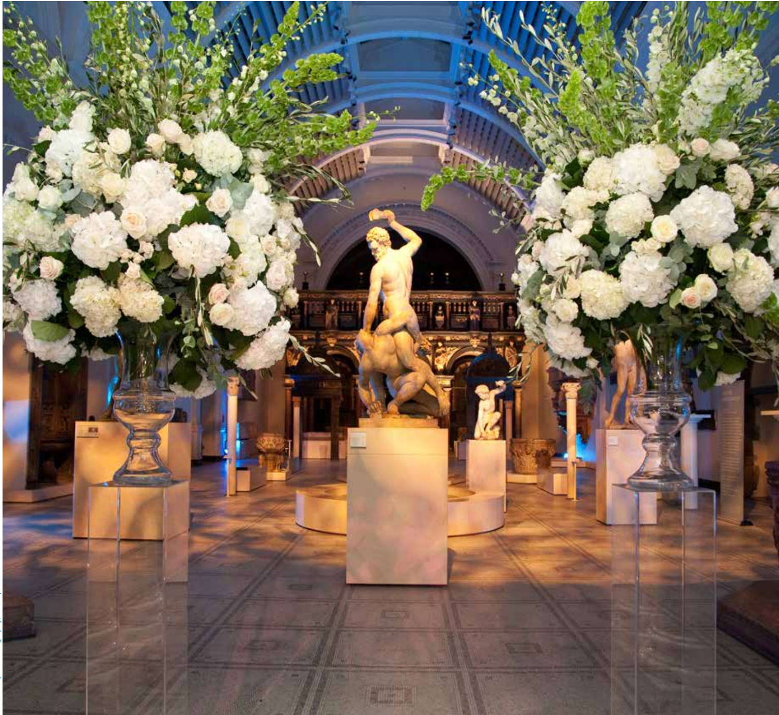
© Clarke Caplin Photography, Pinstripes and Peonies