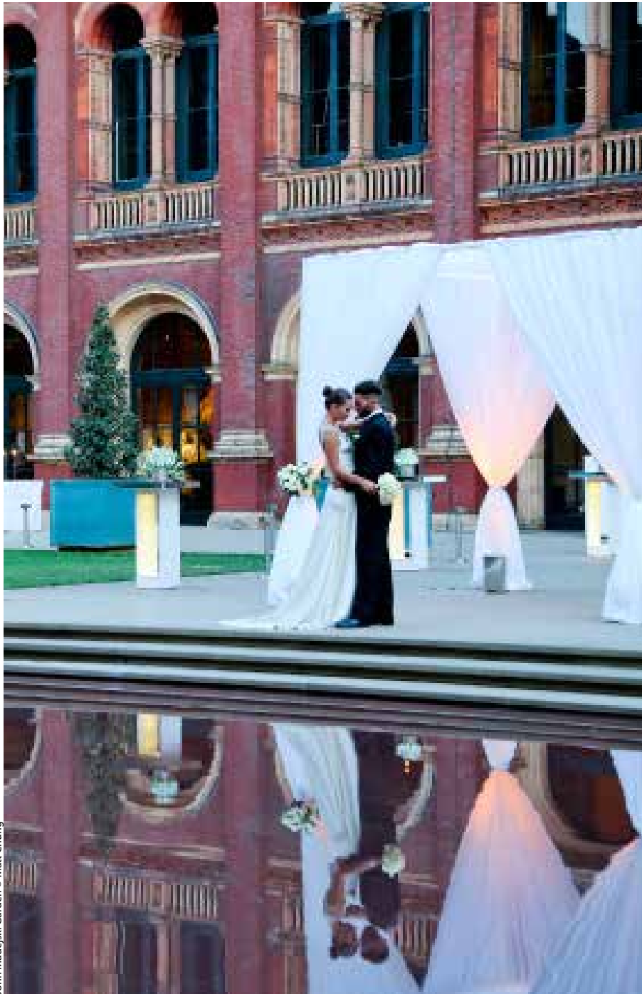
John Madejski Garden

Wedding Celebrations at the Victoria and Albert Museum South Kensington, London