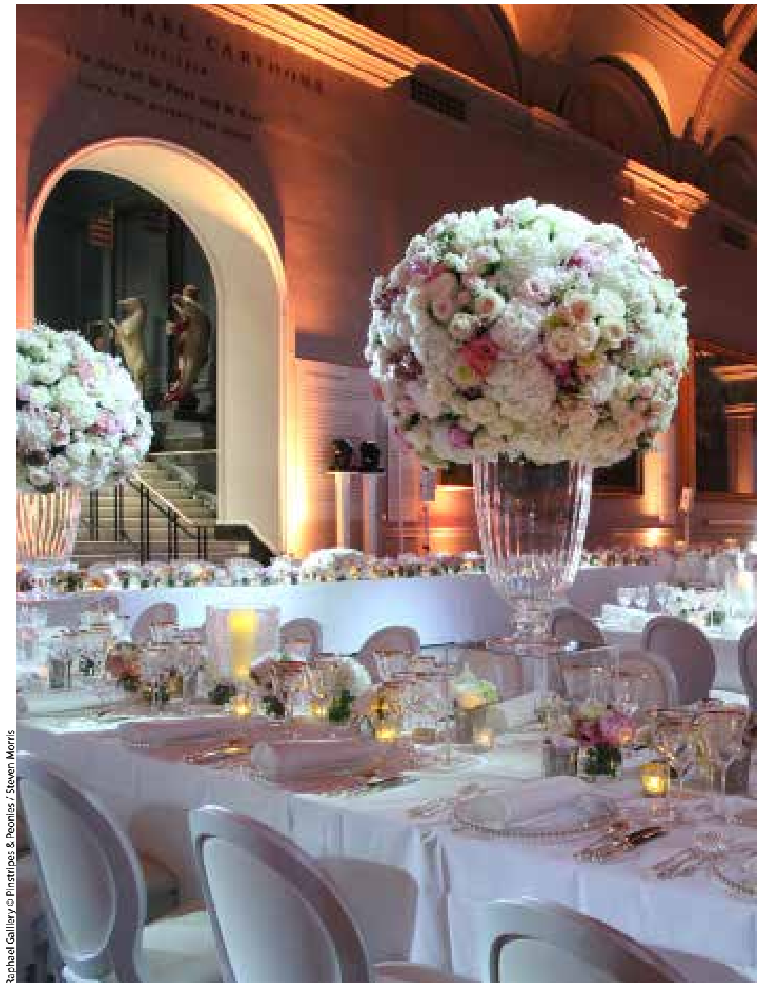
Raphael Gallery