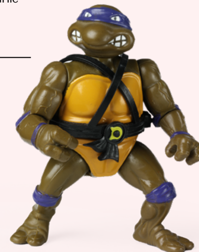
Teenage Mutant Ninja Turtle figure, Donatello, made by Playmates Toys in 1988

Young V&A, opens Saturday 1 July 2023 Cambridge Heath Rd, Bethnal Green Members' Preview Day - Friday 30 June