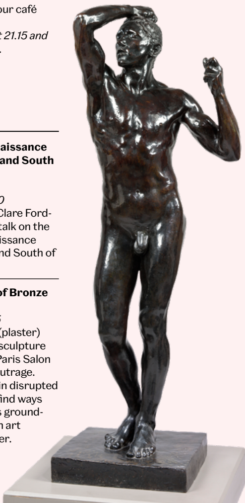
Cover Image © Hydar Dewachi. Right: Auguste Rodin, The Age of Bronze (L'Âge d'Airain), France, ca. 1876, Bronze

C Gallery 21 19.30 / 20.15 / 21.15 When the original (plaster) version of Rodin's sculpture was shown in the Paris Salon in 1877, it caused outrage. Discover how Rodin disrupted expectations and find ways to engage with this ground-breaking work with art historian Jo Rhymer.