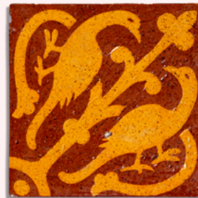
Tile, William Godwin, 1863-1870, England