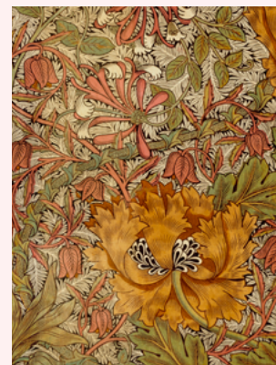
Honeysuckle Furnishing fabric, designed by William Morris, 1876