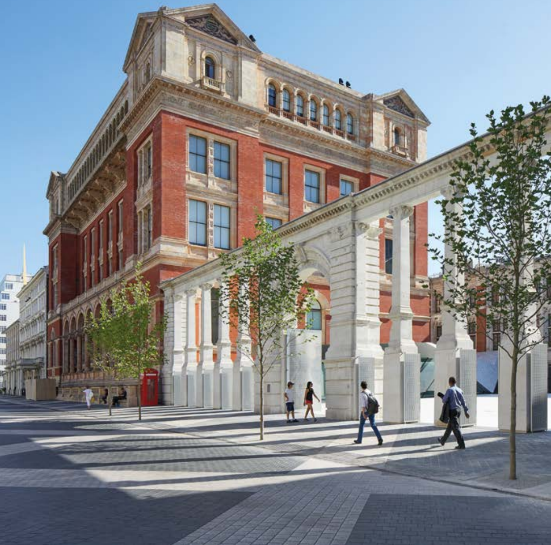
Opposite: V&A Exhibition Road Quarter, Amanda Levette Architects.

As a charity, the V&A relies on philanthropic support. Every donation, large or small, a percentage of an estate or a fixed sum, makes a valuable difference to our work.