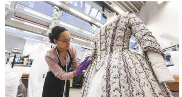
Right: Conservation of a woman's gown, Dutch, 1770s, purchased with funds from the Betty Saunders bequest