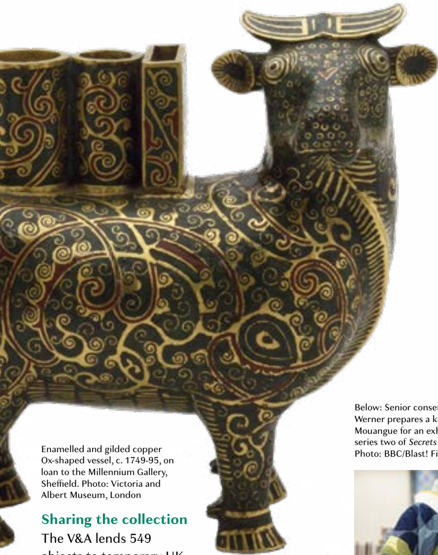
Enamelled and gilded copper Ox-shaped vessel, c. 1749-95, on loan to the Millennium Gallery, Sheffield.