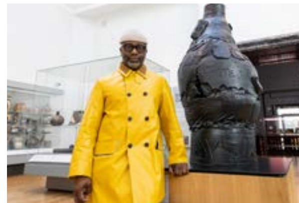
Left: Gates with his work, Voukos #1, 2021, part of Theaster Gates: Slight Intervention #5.

The acclaimed artist explores ceramics, global trade, colonialism and slavery with a display at the V&A, a headline exhibition at Whitechapel Gallery featuring objects from the V&A collection, and a series of creative workshops with communities in Newham.