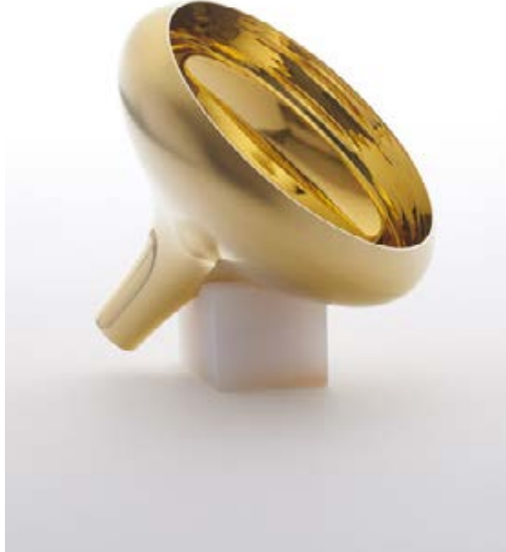
Place to Place by Adi Toch, created in response to the return of a gold ewer to Turkey in 2021.

Liberated from Covid-19 apps and timed tickets, life has returned to the V&A in all its vitality and immediacy as our seven-day public opening and pre-pandemic programming were restored. Entering through the redesigned Grand Entrance from Cromwell Road, visitors can again delight in the full spectrum of museum-wide activity.