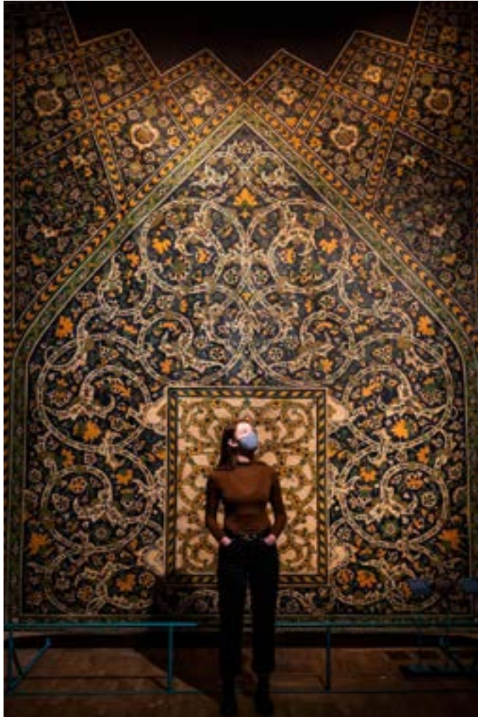
A visitor during Epic Iran.

This has been a year of significant rebuilding and recovery for the V&A and we continue to work to mitigate the lingering effects of Covid-19. Yet the V&A's remobilisation is an extraordinary milestone to celebrate. After so many false starts and delays, it was such a joy last May to welcome visitors back for the first time since 2020 to all seven miles of galleries across the museum, and to a vibrant programme of events and exhibitions. While we utilised every opportunity to maximise our digital offerings during lockdown, it felt even more exciting to be back in real life.