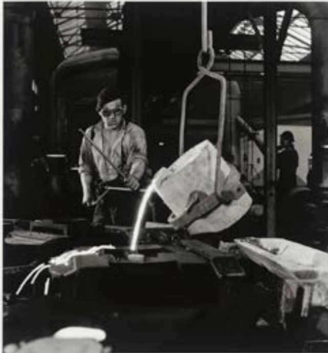
Die Casting 1954.