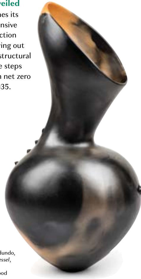
Magdalene Odundo, Asymmetric Vessel , 2021.

The V&A launches its most comprehensive Sustainability Action Plan to date, laying out museum-wide, structural changes and the steps needed to reach net zero emissions by 2035.