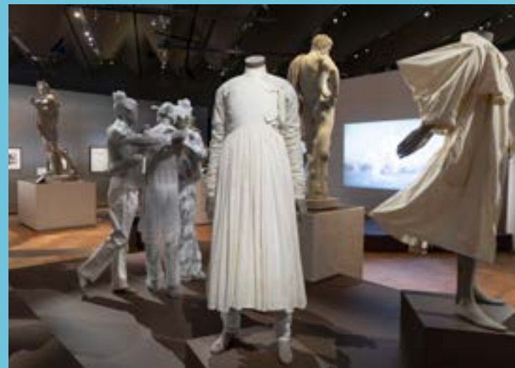
Installation view of Fashioning Masculinities: The Art of Menswear .

Fashioning Masculinities: The Art of Menswear 19 March–6 November 2022 In partnership with Gucci With support from American Express®