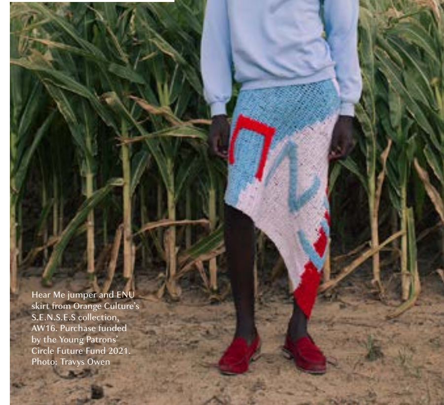
Hear Me jumper and ENU skirt from Orange Culture's S.E.N.S.E.S collection, AW16. Purchase funded by the Young Patrons' Circle Future Fund 2021.